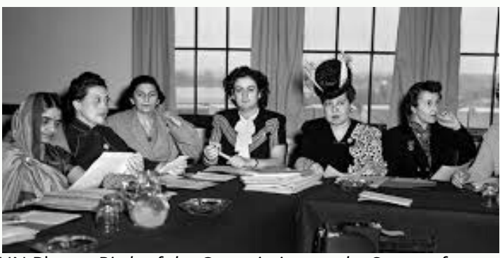
Birth of the Commission on the Status of Women, 1946

Beijing for the first time free from their Governments' control. The Americans were finally able to lay claim to the leadership of the international women's movement. Eastern European women would be re-educated into accepting Western feminist perspectives.