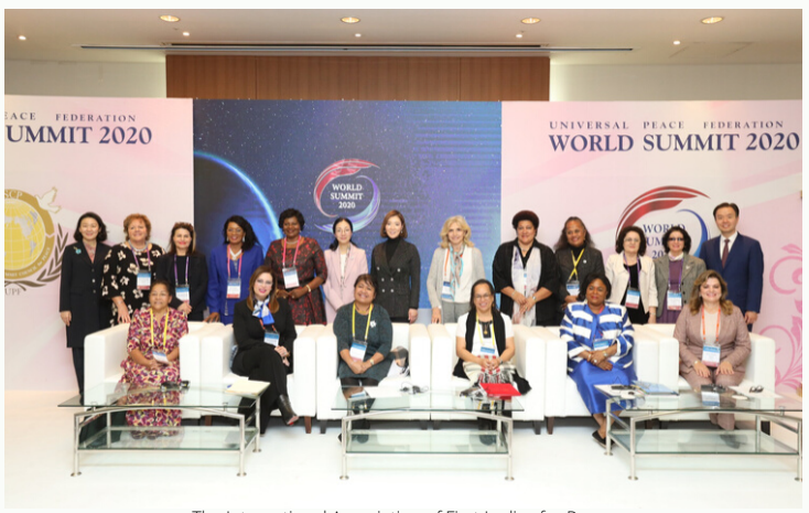
The International Association of First Ladies for Peace (IAFLP) was held on February 5 in South Korea.

Unanimously passed at the conclusion of the assembly, the IAFLP Resolution stands up for the central role that women and mothers have played throughout human history and as "decisive contributors to reconciliation, peacebuilding, reconstruction and development in the wider society and world."