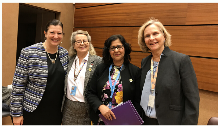
Partnerships for the Goals at UN Geneva: UN Women, governments, civil society