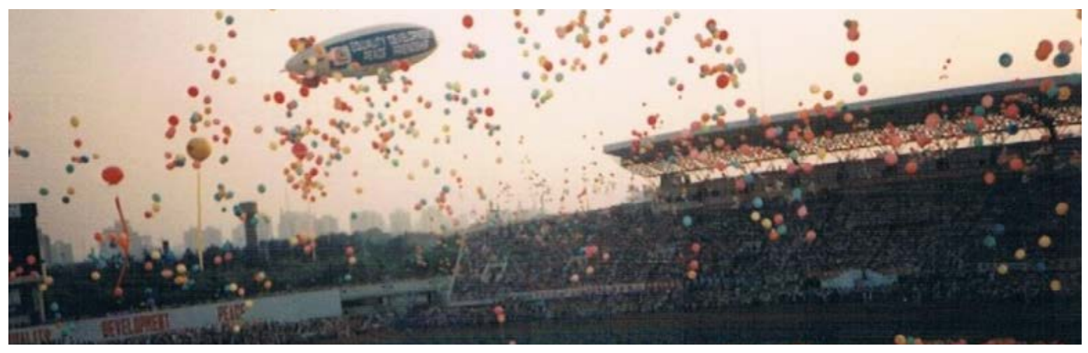
More than 30,000 women from around the globe attended the Fourth World Conference for Women in Beijing in 1995.