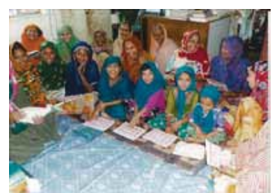
Bangladesh -Literacy Class