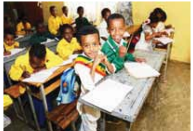
Ethiopia -One Hope Garden