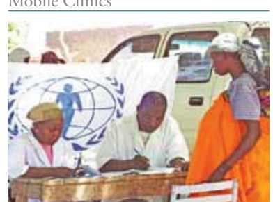
Niger - Health checkups for pregnant Women in villages with no doctors