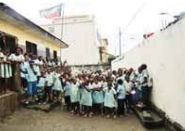
Equatorial Guinea - Motoko Shiroma Kindergarten and Elementary School