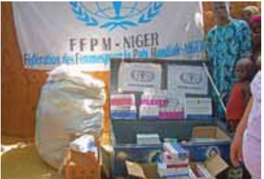
Villagers can buy medicines cheaper from this box than anywhere else

Making medicine available in doctorless villages of Niger