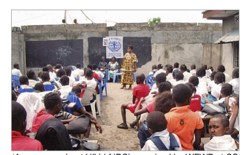
'Awareness about HIV / AIDS' organized by WFWP at CS MUKABA