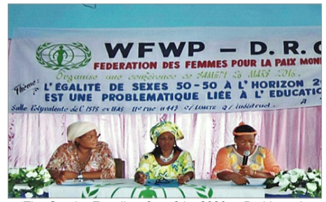
'The Gender Equality 50 – 50 by 2030, a Problematic related to Education' a WFWP RD Congo conference held on 26/03/2016.