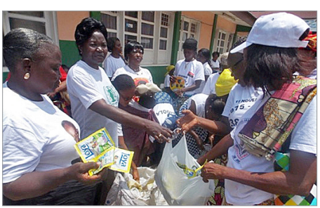
Delivery of goods (milk, sugar, coffee, rice and loincloths) for the needy