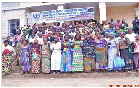
Inaugural Conference of WFWP on the topic of 'Women's Dignity? to establish a Society of Peace' held in Bukavu on 10/08/2014.