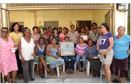
Mothers Day Celebration