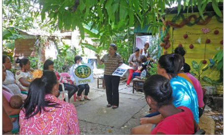
Seminars for Women @ NGOs