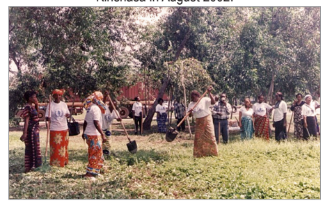
Agro-pastoral projects organised by WFWP RD Congo