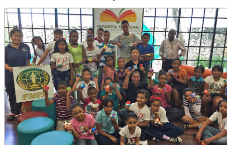
Origami Classes in various communities for children age 7-12