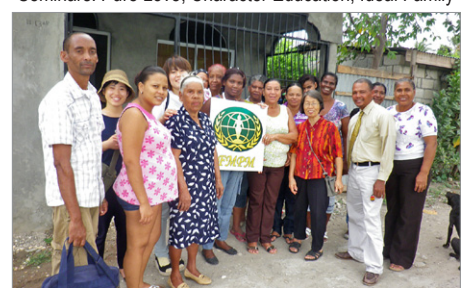
Seminars in Neighborhood Homes