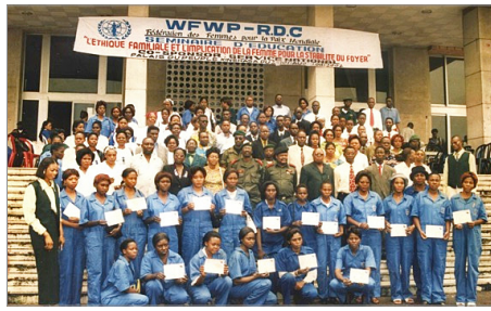
'Family Ethics and the Role of Women in the Stability of the Home' educational seminar organised by WFWP RD Congo, co-sponsored by 'Service National' held in Kinshasa in August 2002.