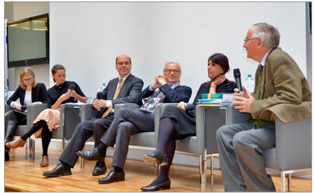
Speakers and Moderator of Panel 1

Mr. Othmar Karas, Member of the European Parliament, sent a video message expressing his gratitude to the organizers for launching this conference focused on finding practical solutions to the serious challenges facing modern cities, as a result of globalization and migration. For European cities to attain a more inclusive worldview and contribute to global solutions, it should be in our interest to work on a rules-based world order rooted in multilateralism/multiculturalism.