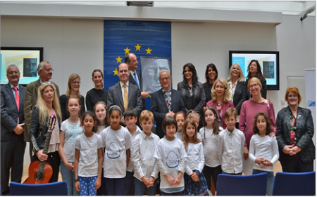
Children's Choir, European School Goldschlaggasse

The Children's Choir of the European School Goldschlaggasse performed, and provided a colourful musical introduction to Panel 2.